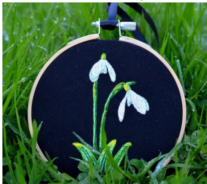
Embroidery Workshop 1pm - 5pm 18th December, Falmouth £35

Kick off your jolly season and get festive by embroidering yourself a beautiful Snowdrop hoop to decorate your tree! Mulled wine, mince pies and everything you need to make your hoop will be there to fill your boots with Christmas cheer! So just bring yourself (and a friend if you fancy) and come and have a lovely time! Come along and learn how to make the Snowdrop design, something that can be hung on your tree at Christmas and then on the wall in the New year, looking forward to the future of 2020.