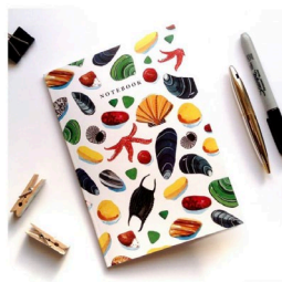
The Sea Garden