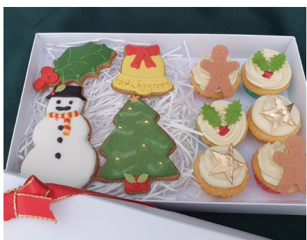
Christmas Mini Treat Box