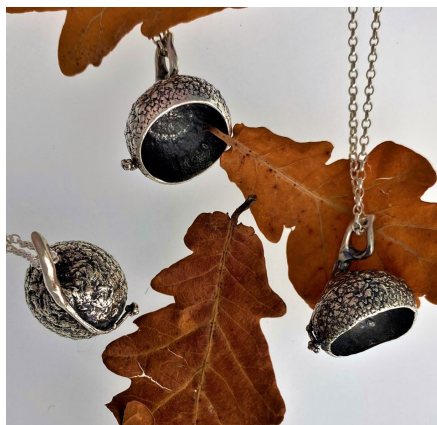
Acorn Hat Pendant £96

Join me on a whimsical tale into autumn & beyond to ignite your child's imagination with my new Interaction Jewellery collection; The Acorn Hats. Pop the Acorn hat onto your finger and uncover the story telling elements that lie waiting for you and the little people in your world, strengthening bonds and growing imaginations. The Acorn Hats, are hand-crafted in sterling silver with an interactive element to be enjoyed with children, parents & grandparents alike; a timeless design with heirloom quality. Memories of childhood walks with my Dad in the woods foraging for treasure in the undergrowth and acorn hats inspire this new collection. We would make our own "Museum of Autumn" when we got home and finger-puppet-shows with our Acorn Hats. I hope that this collection will inspire you to do the same with your children. (Different chain lengths available )