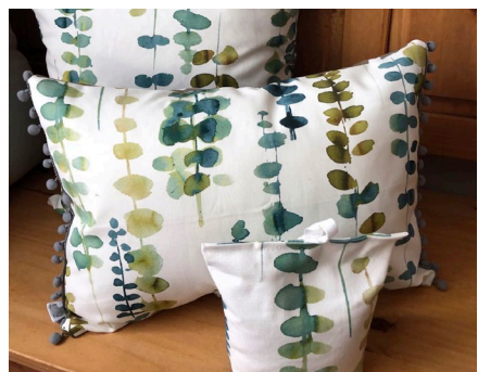
Eucalyptus Product Collection £10 - £15

Eucalyptus fabric range of products, also available in other designs, and some just for the festive season. All handmade and crafted by Sarah including cushions, doorstops and a multi media device holder. All available at Christmas markets listed on social media. You can also shop through CraftsbySarahGB on Esty.